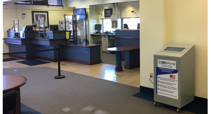
Royal Credit Union branches in 22 neighborhoods across Minnesota and Wisconsin recently installed 42 ISO-Aire RSF500 models equipped with commercial HEPA filtration and ozone-free bipolar ionization.