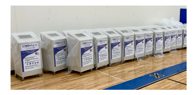
ISO-Aire delivers proven COVID-19 mitigation strategies recommended by ASHRAE and the CDC.

Groves Academy purchased 50 ISO-Aire RSF300 classroom units (above) and six RSF1000 air purifiers for larger, high-traffic spaces utilizing federal COVID-19 grant funding.