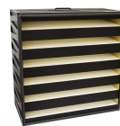
HEPA (99.99% at .3 microns)